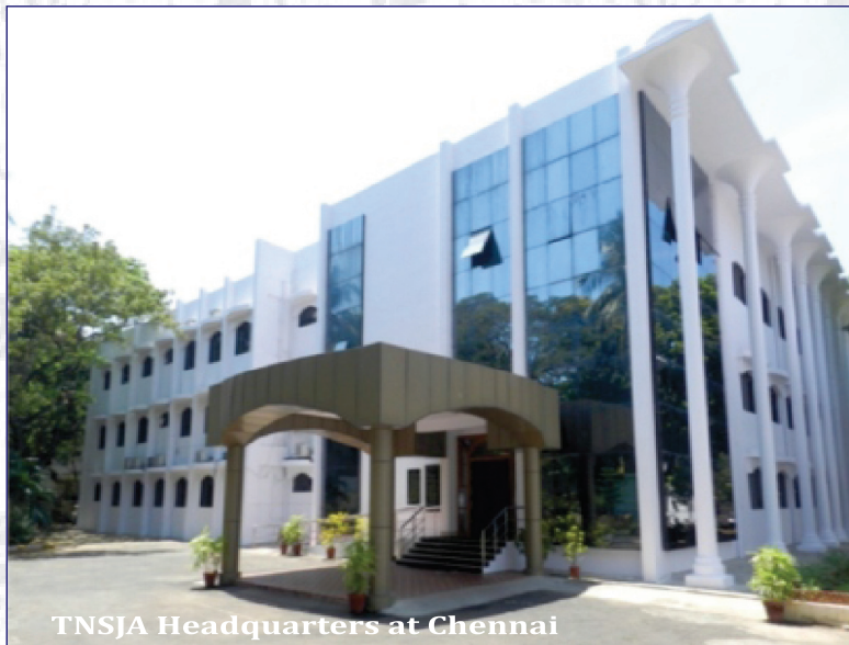
TNSJA Headquarters at Chennai